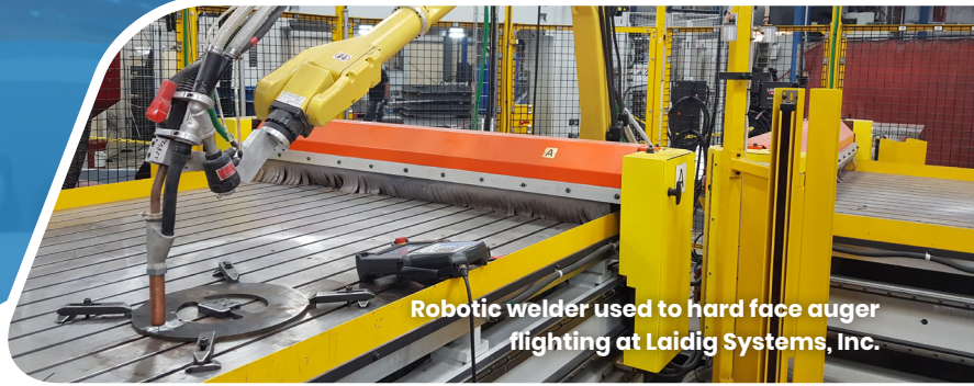
Robotic welder used to hard face auger flighting at Laidig Systems, Inc.